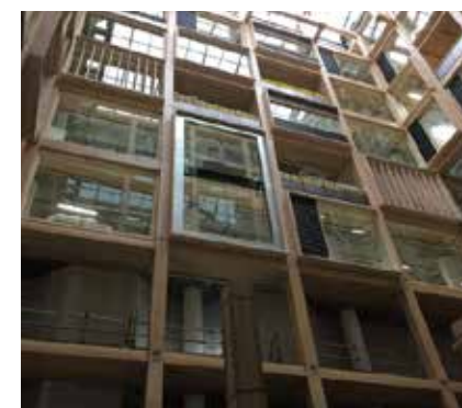
ANCHORAGE PLACE ATRIUM