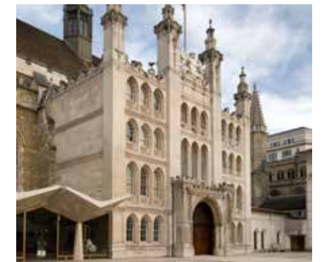
THE LONDON GUILDHALL