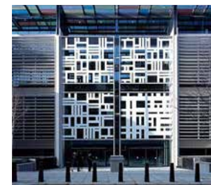
THE HOME OFFICE LONDON