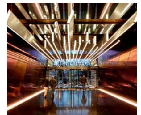
ALPHABETA OFFICE BUILDING, LONDON