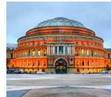
THE ROYAL ALBERT HALL