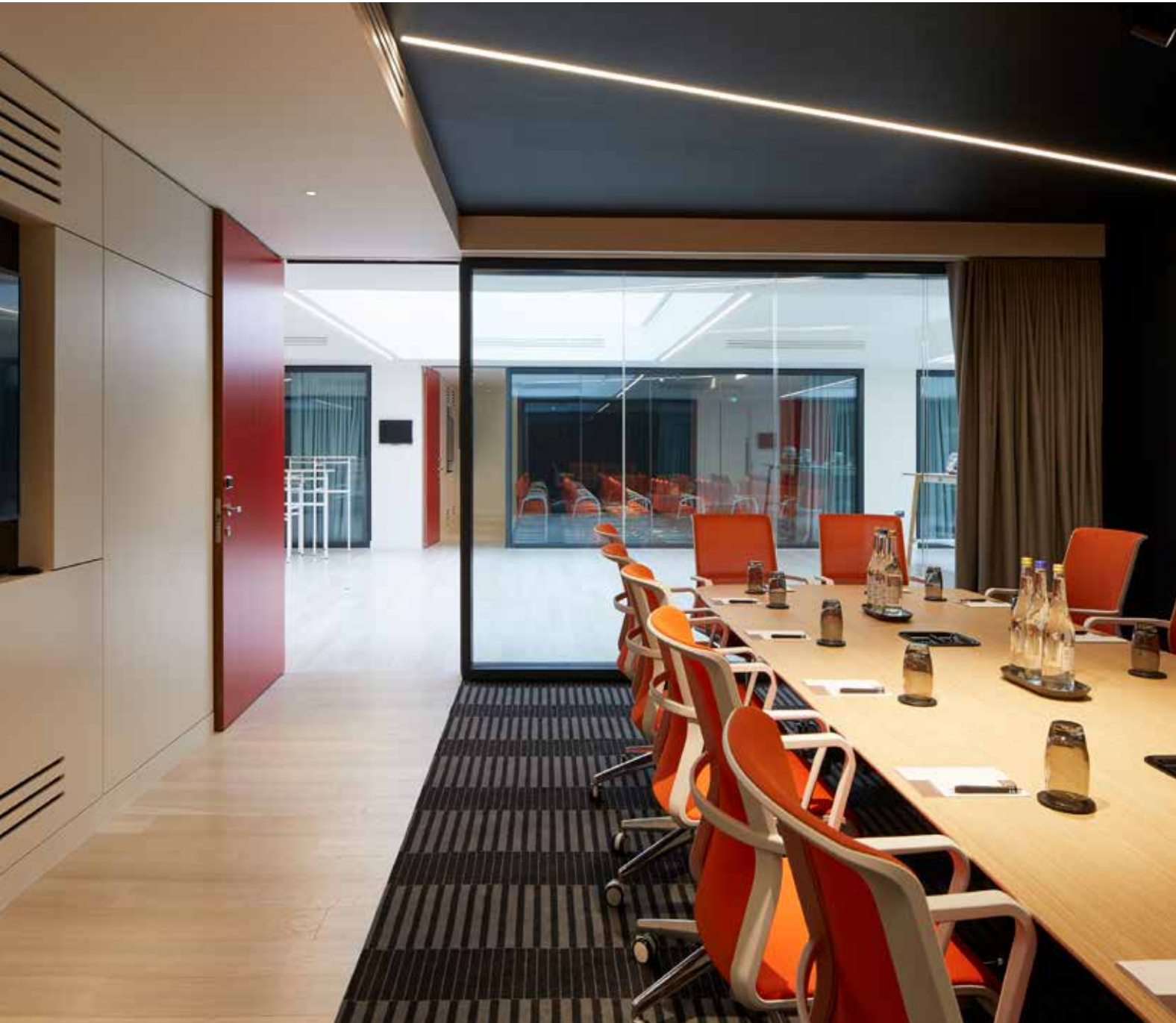
Apex City of Bath Hotel

A highly skilled and experienced specialist joinery contractor concentrating on luxury hotels, apartments and commercial projects, covering London and the South East.